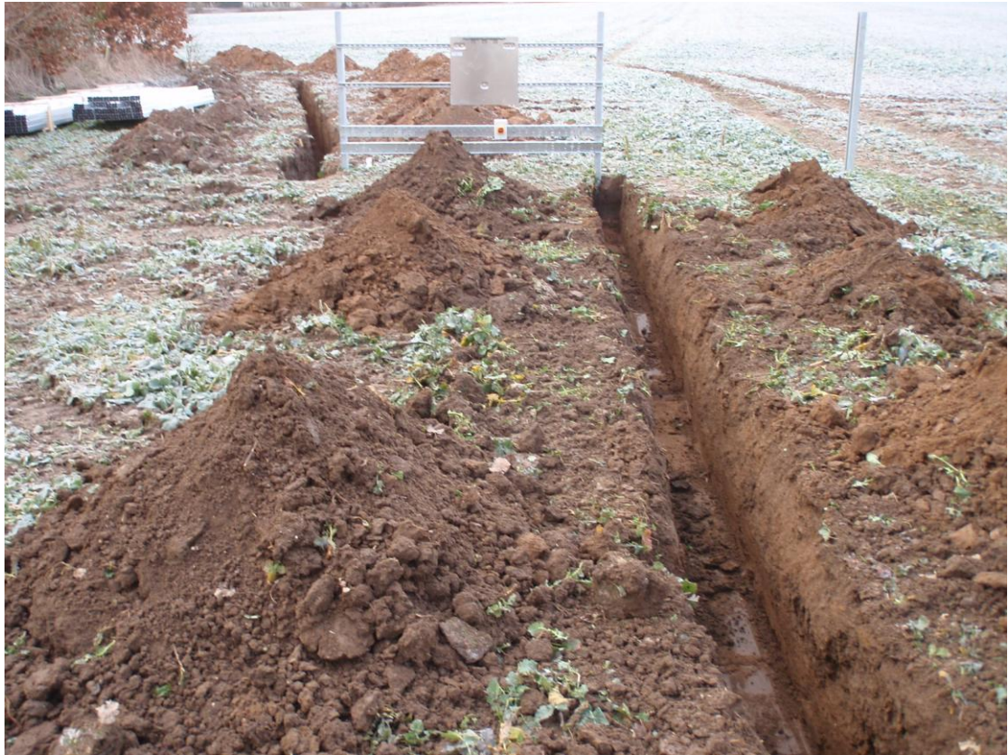
Plate 1. Showing excavation for cabling (facing south)