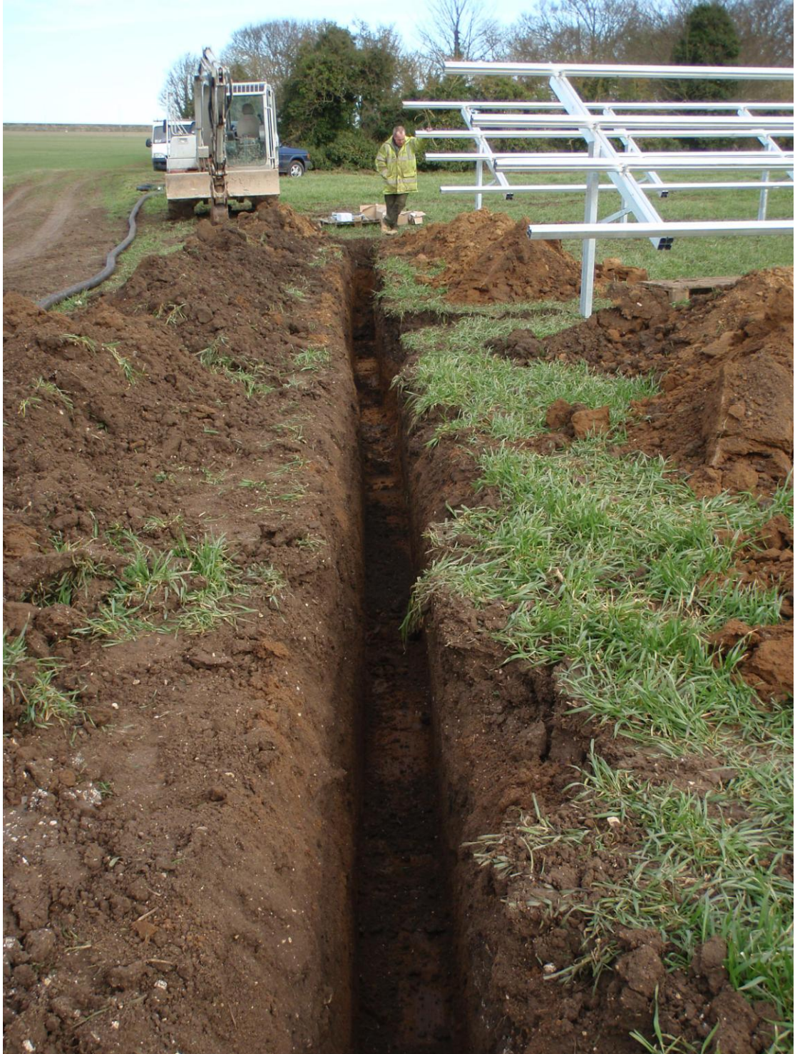
Plate 2. Showing excavation for cabling (facing north)