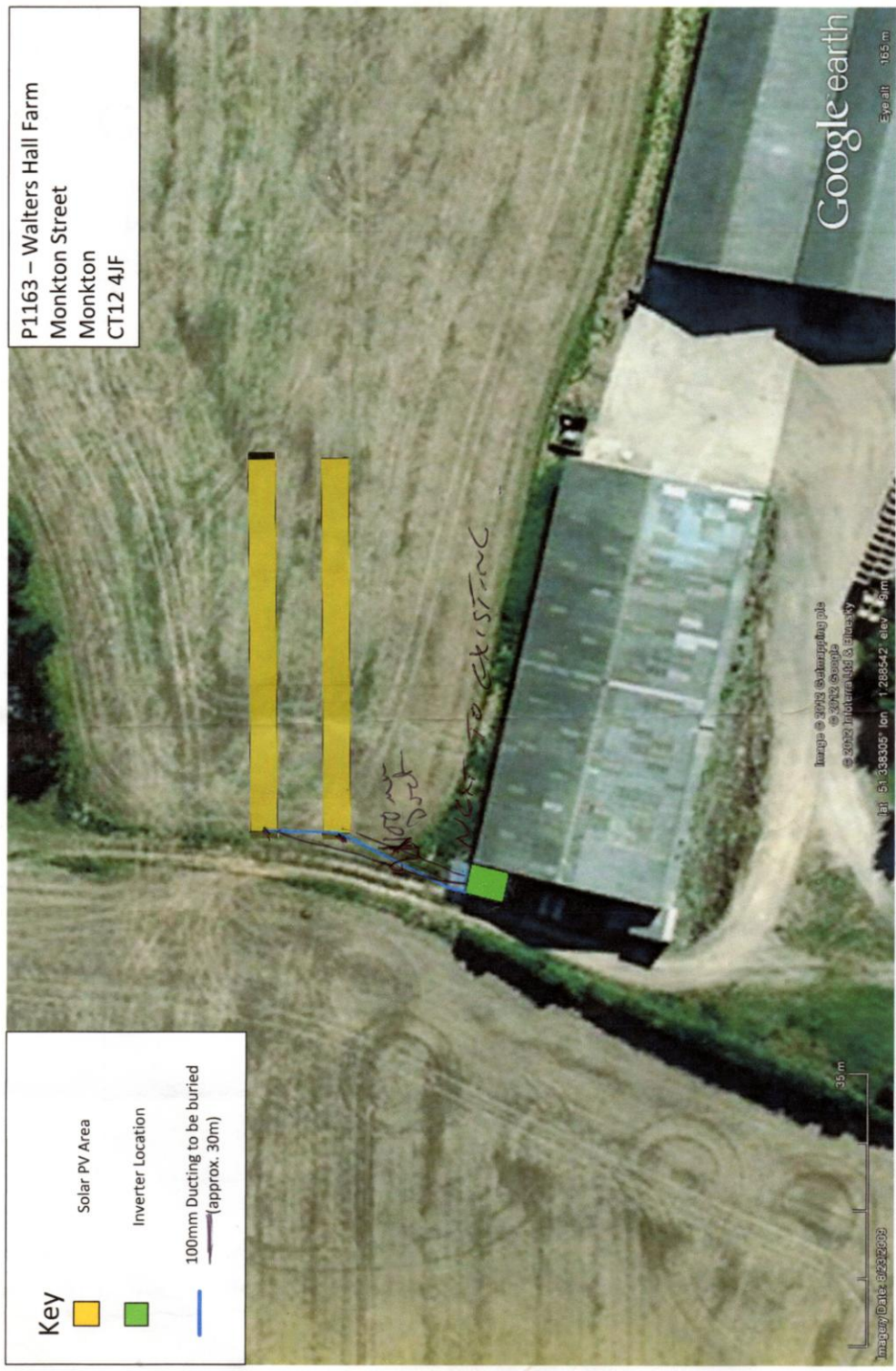
Plate 3. Showing aerial photo of site with proposed installation